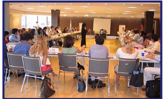
Summer Fellows kick-off training, June 2006.

Each of our 4 MBA students was sponsored through a newly-created Social Impact Fellowship at the